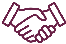
Strategic Partnerships With Community Healthcare Providers