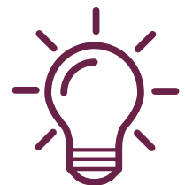
Innovative Services and Solutions