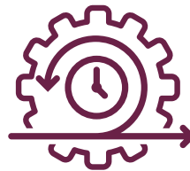
Flexible and Proactive Teams