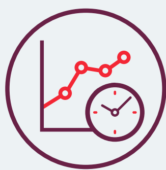
Real-time data updates and analytics