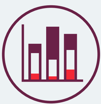
Streamlined study operations