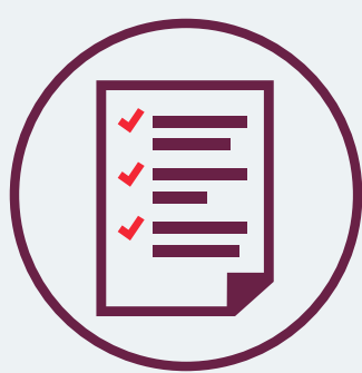
Standards-based source data collection

IntelliGO SM Research Stack technology is the only system designed to work in a real-world healthcare environment, collecting data at the point of care using CDISC global research data standards, then automatically using it for regulatory compliance and study operational management.